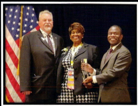
VA's National Advisory Committee's (NAC) Female Volunteer of the Year 2023